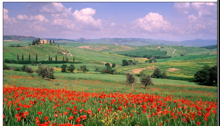
Our scenic ride thru breathtaking countryside in Tuscany

The morning is free for exploring or last-minute shopping in Rome . Then we go on to everyone’s favorite region of Italy – Tuscany , & some of the places from our D.A.G. original classic tour, “ Under the Tuscan Sun ”, over the next few days. We will be staying in the same hotel in Tuscany , & then we take day trips to some of the most beautiful & most famous Tuscan towns . And that includes the second of two of the “ 7 Wonders of the World ” that you will see on this Grand Tour of Italy in the Spring of 2018. We stay in the all-time favorite Italian & Tuscan towns for members of The Detroit Anthropology Group, the very quaint Prato. We stay in a comfortable 1st-class hotel in the center of town. After check-in, we’ll take a casual walking tour and orientation stroll around this very charming town, with castles and wonderful Italian and Tuscan restaurants . Tonight we’ll attend a free medieval concert in St. Stefan’s Duomo (Cathedral) on Piazza Duomo, a 4-minute walk from our hotel. Before going to sleep tonight, be sure to read your “ Bliss Sheet ” that will tell you all about tomorrow’s scenic day trip thru the Tuscan countryside to the well-preserved & ornate village of Lucca , a D.A.G. favorite in Tuscany for many years.