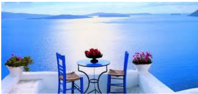
The view from the restaurant at our hotel on Aegina island.

Thought by some people to be the “lost continent of Atlantis”, Aegina is one of the most scenic & most interesting of the Greek islands. Beautiful beaches, colorful folklore, quaint villages, interesting shops, & music reverberating through the streets..... that’s Aegina . And if that’s not enough, many archaeological treasures are found here, including ancient temples of Minoan culture. Bouzouki music in the tavernas, belly dancers, Greek folk dancers in the streets & sea side cafes highlight the evenings in this magical setting. This is Greece. And of course, you’ll have “your own private anthropologist” to explain the ancient treasures to you. This afternoon, we’ll be picked up by a private bus & professional guide to take us on a tour of the island of Aegina, and most importantly, we visit the stunning Temple of Apollo at the tip of a narrow stretch of land leading out into the Aegean Sea. You’ll never forget this magical site, dating back to 6 centuries before Christ . Then we continue on, past tiny Greek fishing villages, olive groves, & vineyards that produce wine for the Greek gods. This is Greece.